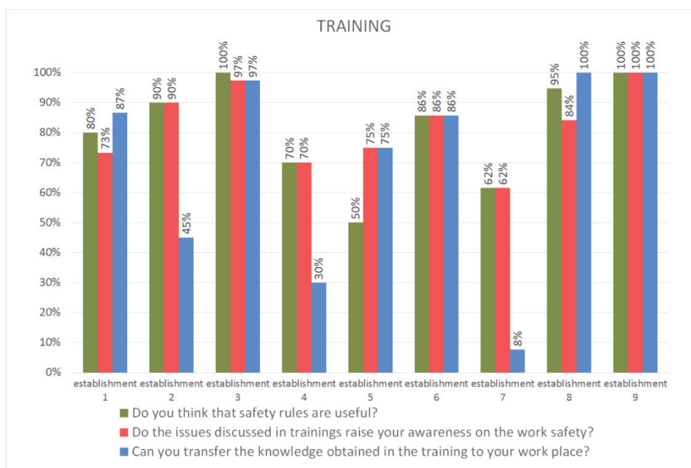
Figure 2. Results of positive answers concerning issues related to trainings

fact that there are meetings held, at which rules, safety rules and safety rules issues are discussed in detail, not all employees can transfer the knowledge obtained at the training to their work place. Confirmation for this situation is the fact that in one establishment, only 8% from among all employees can use the obtained knowledge in practice. Employees of all establishments agreed that the issues discussed at the meetings rise awareness on the work safety. Employees of all establishments agreed that the issues discusses at the meetings rises awareness on the work safety.