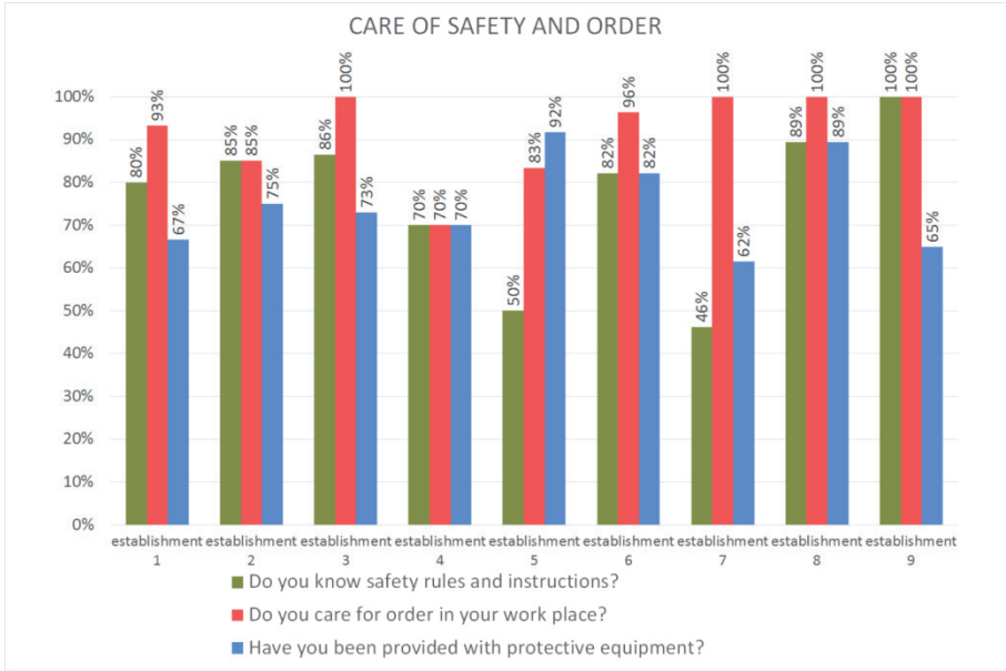
Figure 4. Results of positive answers concerning issues related to care for safety and order at the work place